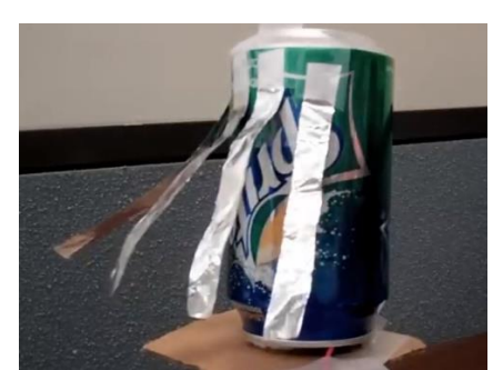
Figure 3: The effect of charge repulsion on aluminum foils in the Van de Graaff generator.